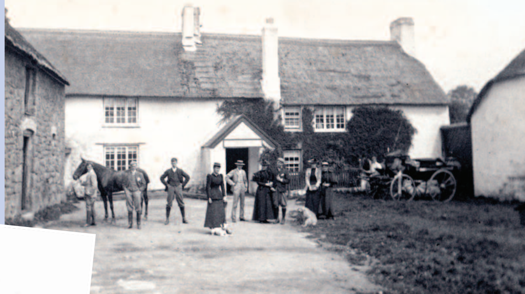
Above: The yard at the Ring of Bells in 1894 from a photograph by Robert Burnard and (below) a reconstruction of the scene in 2015 showing remarkably little change.