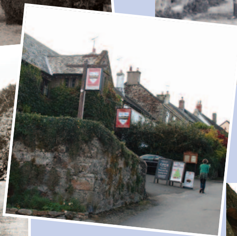
Left: The Oxenham Arms today. Built into the fabric of the building there is said to be a prehistoric menhir. It's certainly a feature worth the visitor seeking out.