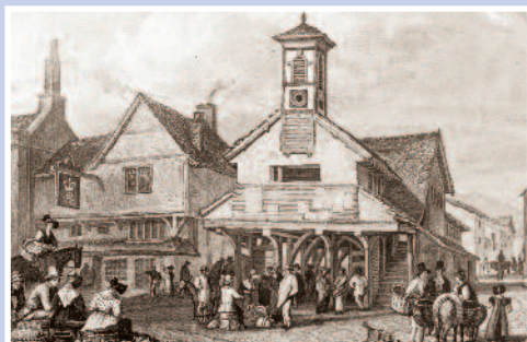
Ashburton Market Place c.1820. The Rose & Crown inn stands on the left of the market house.