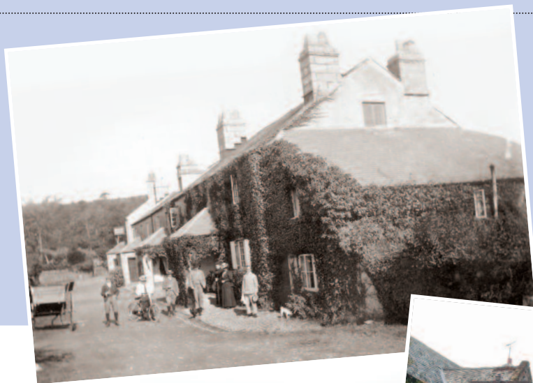
Visitors to the Rock Inn in the late 1890s, just a few years before Doyle's own trip to Dartmoor.